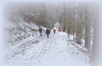
Walking group - Welsh Hills 2006