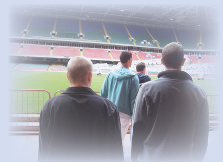
Visit to the Millennium Stadium Cardiff 2007