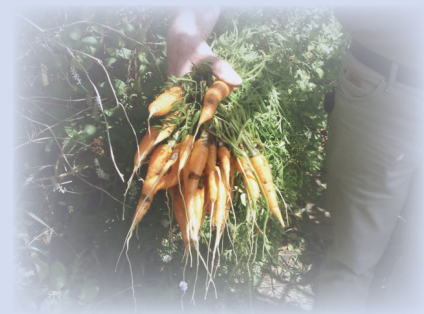
Produce from the unit allotment