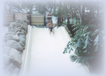
Unit holiday 2004 - Centre Parks