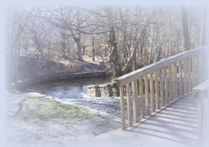
Forest of Dean cycle trail picture taken by resident 2007