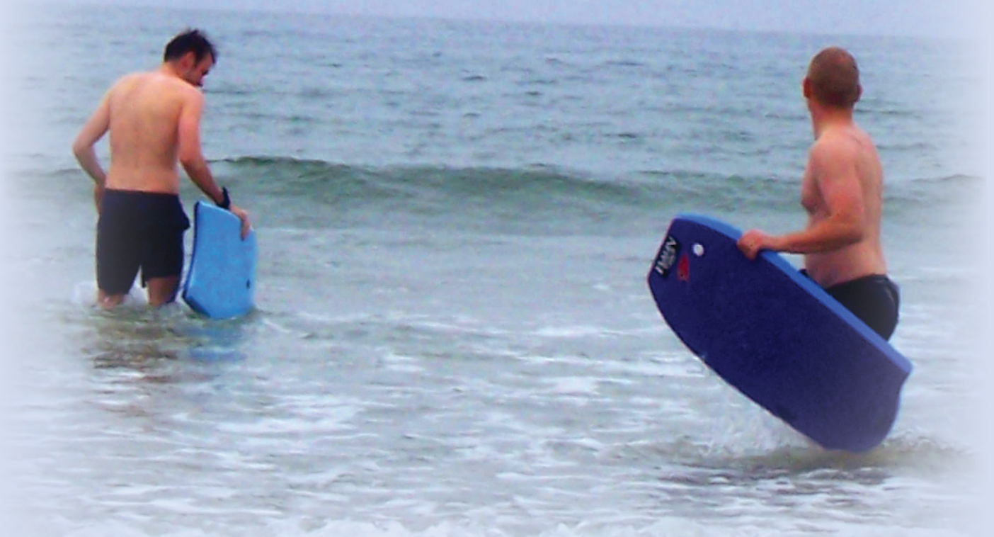
Unit activity 2007: Surfing the "Gower" in Wales

Tel 01452 891581 Fax 01452 891585 www.montpellier.glos.nhs.uk